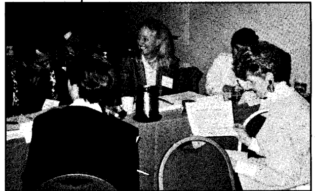
The potpourri session of the February 20th CD Workshop