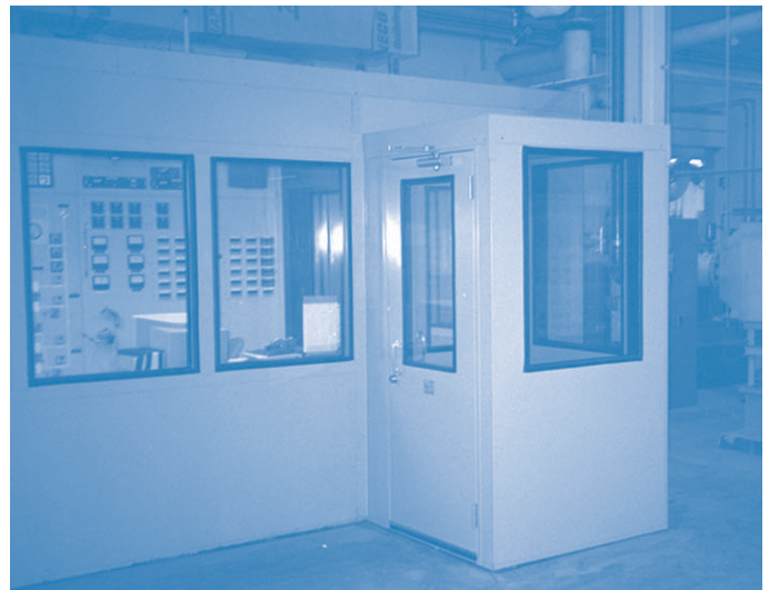
Example of a specially designed, well-sealed acoustical enclosure.

As an OHC, you are a key member of the hearing conservation team. Although you may not develop engineered solutions to noise exposure problems, you will no doubt be called on at some point to identify problems, suggest possible solutions, evaluate technical recommendations and possibly even prioritize projects. Your familiarity with the benefits, procedures, approaches and materials involved in engineered noise controls will be invaluable to the members of your team, and it will certainly make the experience more enjoyable. Most importantly, it will help ensure a properly designed solution that is well thought out and therefore effective, practical, maintainable and cost-effective for the employees whose noise exposure it is intended to reduce.